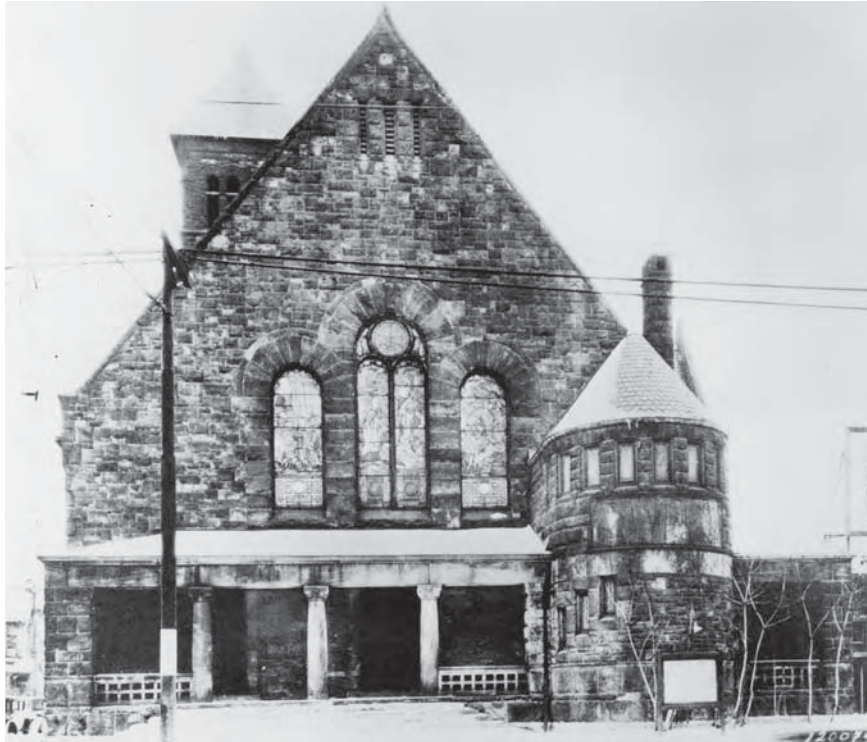
First Unitarian Church, Detroit