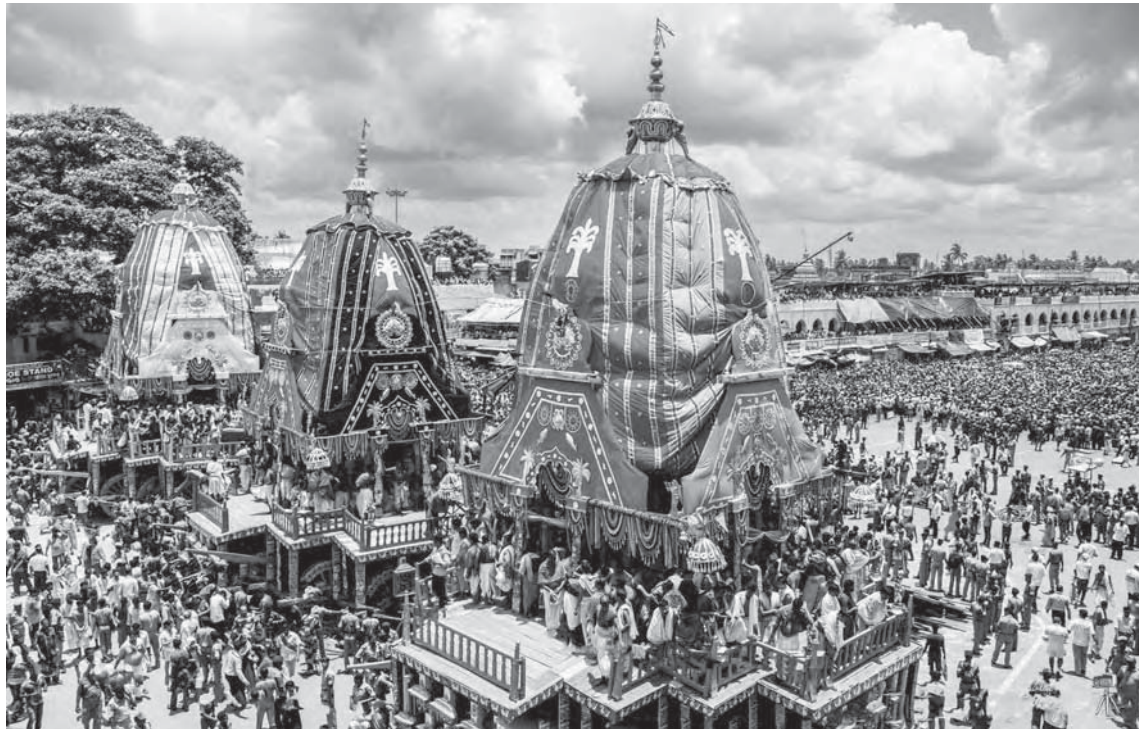
Chariot Pulling during Sri Jagannath Chariot Festival at Puri

religion of non-self. It holds that all self is bad and all non-self is good and that by living true to the philosophy of non-self, one may attain infinity. The Christian religion is one of self; egotistical in its aspirations, it holds up promises of reward or threats of punishment. It is egotistical also in asking its practitioners to 'do unto others as you would be done by'. This means that, as Swamiji observes, the thought of self always underlies the Christian creed. 24 The golden rule that Christianity teaches its adherents is: 'love thy neighbour as thyself'. The Hindu religion goes further than this golden rule of Christianity and teaches its followers to treat neighbours better than the treatment received from them. By all means, this is impeccable morality and cannot be excelled by any other religion (1.322). Third, Hinduism has a far better theory of love of God than Christianity. In Hinduism true love is absolutely unselfish; it asks for nothing in return. In Christianity, on